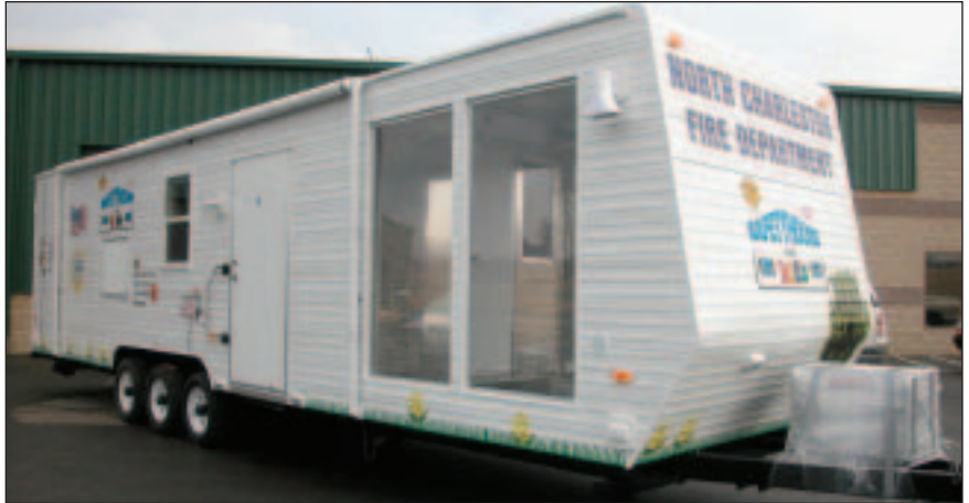
This SCOTTY Combination Sprinkler/Fire Safety House is getting ready to head South to its new home in North Charleston, South Carolina.

“Due to a reduction in the cost of the apparatus, we had money left