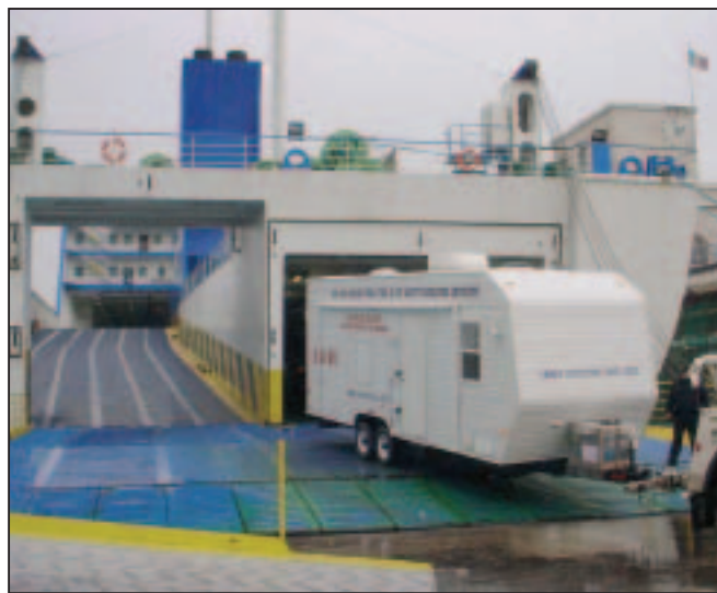
Arriving in the Port of Naples from Sicily, Italy.

The fire safety house has remained at Hickam except when supporting special activities at Bellows Air Force Base, about 30 miles away. Hickam's fire safety program is incorporated into the 15 th Airlift Wing's Annual Fire Prevention Plan signed by the wing commander. Seasonal fire safety themes are discussed at the 15 th Airlift Wing Occupational Safety and Health Council with the squadron commanders. Additionally, fire safety is incorporated into the Base Newcomers Brief, Military Family