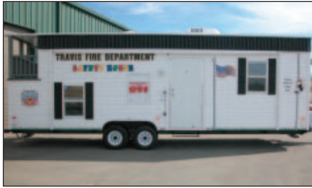
Travis Air Force Base in California is the proud owner of this SCOTTY Fire Safety House model HD-35PC